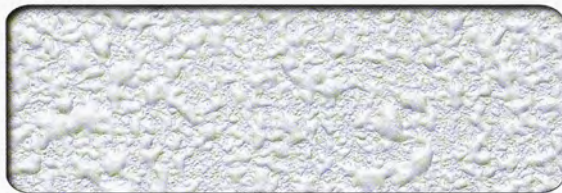
Small mount finish