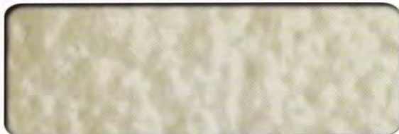
Orange peel finish