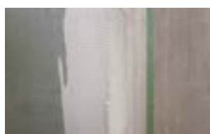
Apply TAILOR UNDERCOAT EX or substrate conditioners to fix and embed Corner Material.