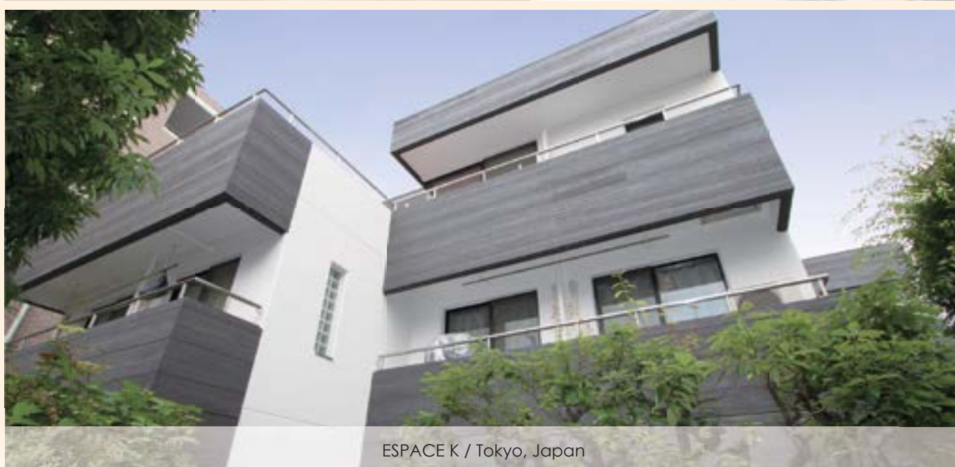
ESPACE K / Tokyo, Japan