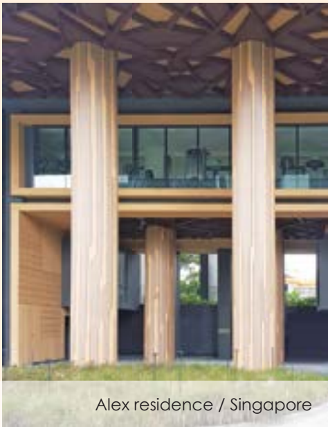
Alex residence / Singapore