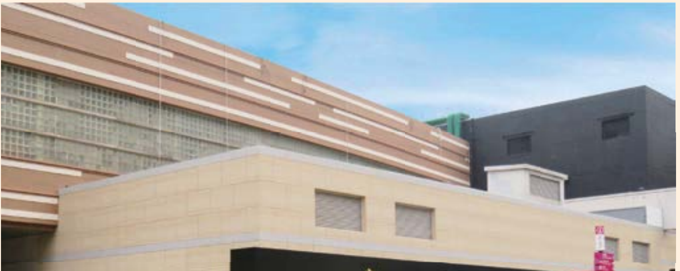
Lok Fu Plaza / Hong Kong