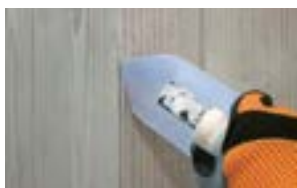
After applying the sheet, apply WOODY SMILE PATCHING MATERIAL to the corner.