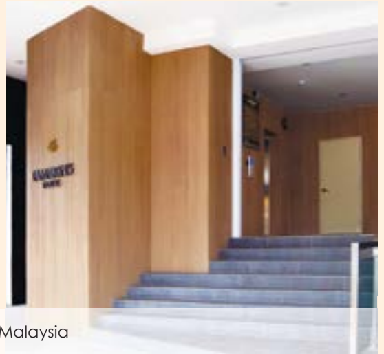
Tamarins House / Penang, Malaysia