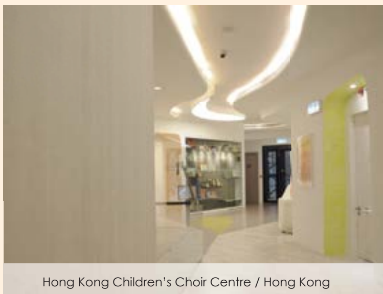
Hong Kong Children's Choir Centre / Hong Kong