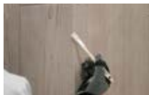
Apply WOODY SMILE PATCHING MATERIAL (topcoat) to the corner with a brush. ※