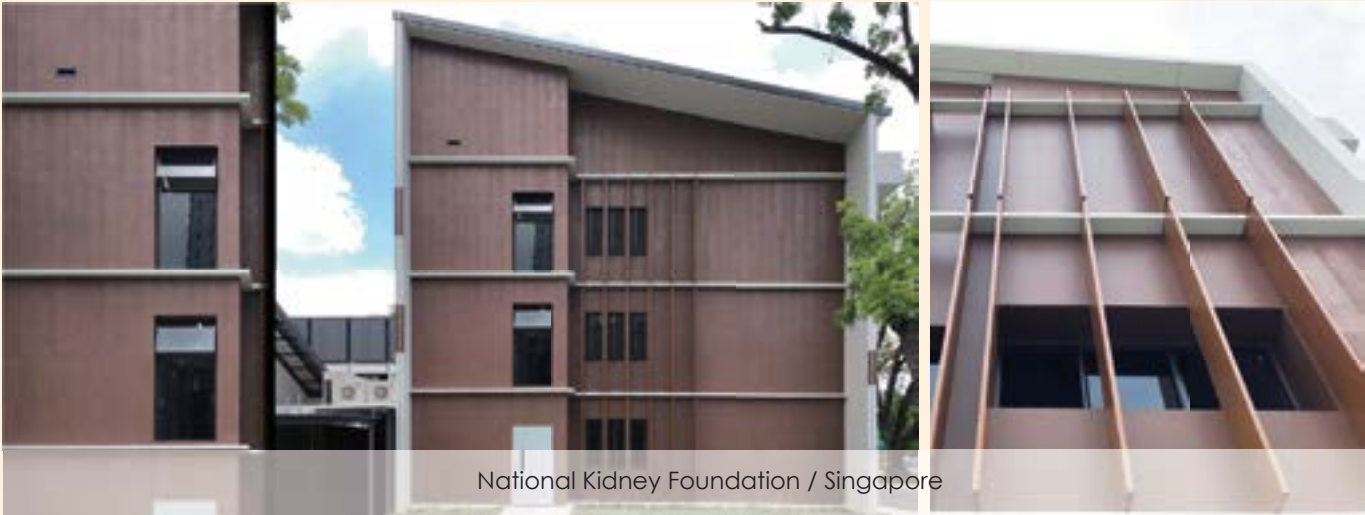
National Kidney Foundation / Singapore