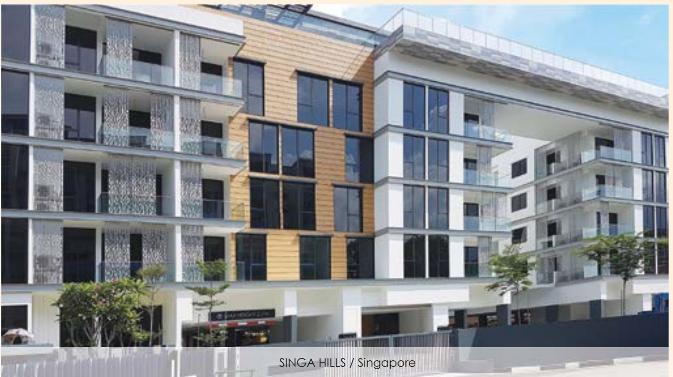
SINGA HILLS / Singapore