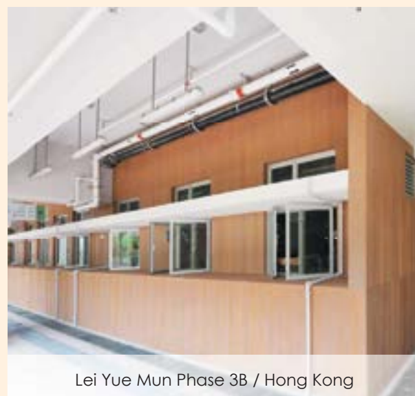
Lei Yue Mun Phase 3B / Hong Kong