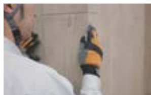
When the patching material dries thoroughly, smooth the surface with a sandpaper.