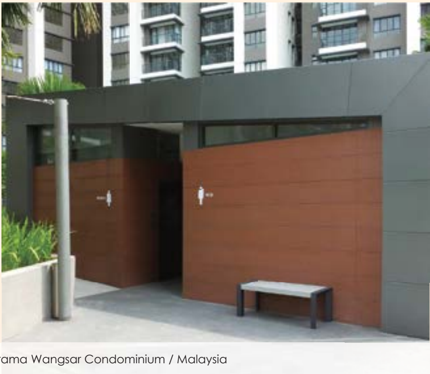
Irama Wangsar Condominium / Malaysia