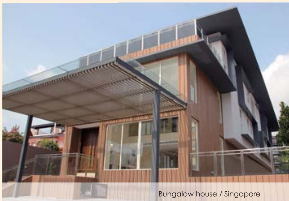
Bungalow house / Singapore