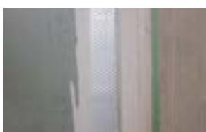
Check the vertical position using a transit compass. Then, adjust both external corners by using Corner Material.